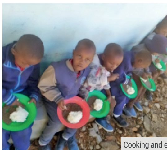
Cooking and eating lentils