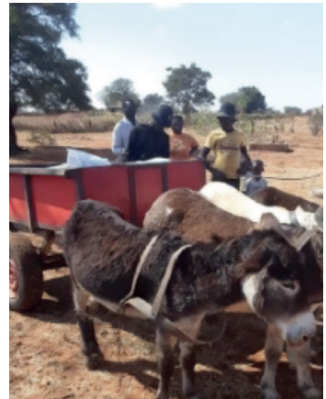
Last mile delivery of the lentils

A critical part of the success of BREAD is effective logistics. To meet the need, BREAD has developed robust logistical supply chains. As a case study and relevant example, the lentils mentioned above began their journey in Port Adelaide in February 2023, where they were packed into a container and sailed to Sri Lanka aboard the ship, the Conti Cortesia. At a short layover in Colombo, Sri Lanka, the lentils were transferred to another ship. They then made their way to the South African port city of Durban, arriving in April 2023. Here BREAD's partners loaded them onto an overland train bound for Zimbabwe. They made the final step of their journey by train to Bulawayo, where the lentils were unloaded and distributed to rural churches in the region in May 2023, who then took the lentils to homes, by human power, by wheelbarrow and by donkey cart!