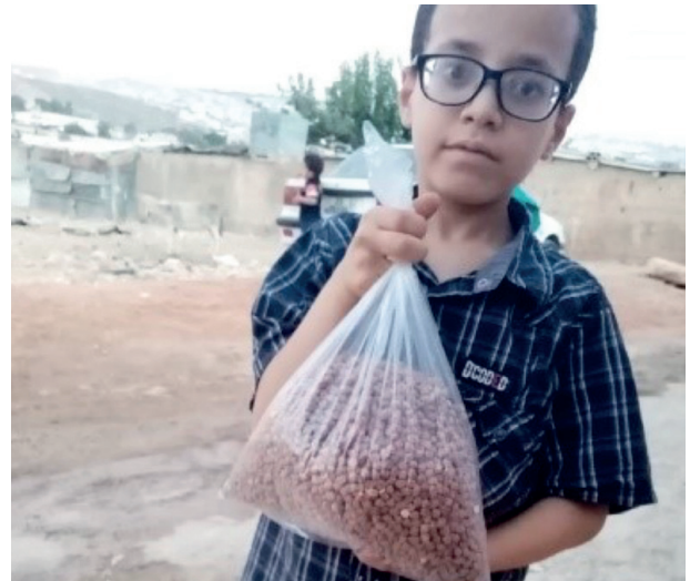
This Iraqi boy was among many child refugees sheltering in Jordan who received a 5kg bag of chickpeas donated to BREAD by an Australian farmer in 2022