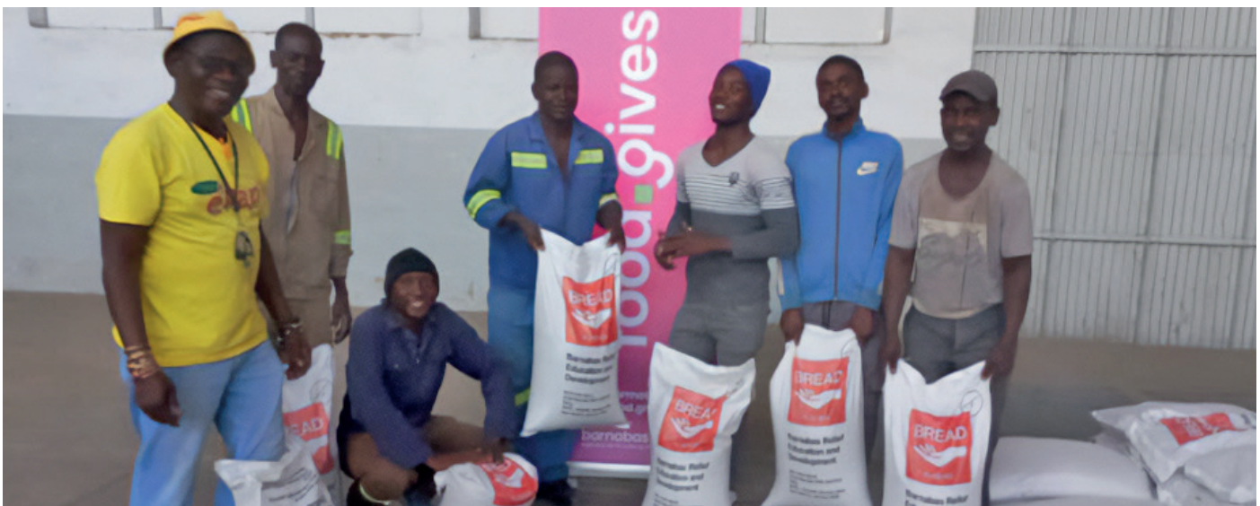
In Bulawayo, the enthusiastic volunteers take a short break for a photo after offloading a whole shipment by hand in three hours!